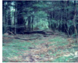
H02022 barbours log chute