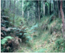
H02022 barbours tramway