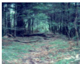
H02022 barbours log chute