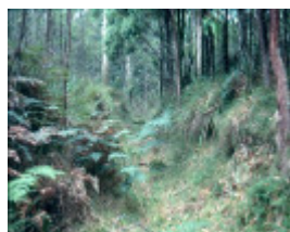
H02022 barbours tramway