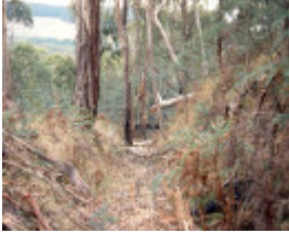
H02020 the glut escarpment log chute