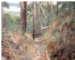
H02020 the glut escarpment log chute