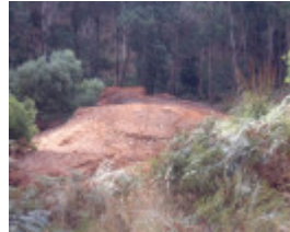
H02013 ordes ogden brothers sawmills sawdust mound