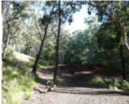
ORDE'S/OGDEN BROTHERS MILL SOHE 2008