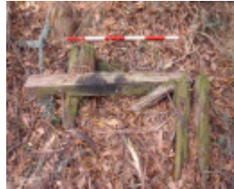
H02013 ordes ogden brothers sawmills mounting