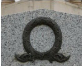
Caulfield War Memorial.jpg