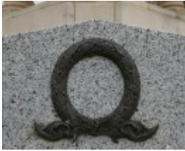
Caulfield War Memorial.jpg