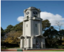
Ringwood Memorial Clock Tower.jpg