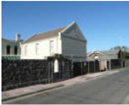
RANNOCH HOUSE SOHE 2008