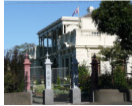
RANNOCH HOUSE SOHE 2008