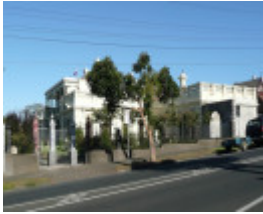
RANNOCH HOUSE SOHE 2008