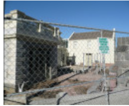
RANNOCH HOUSE SOHE 2008