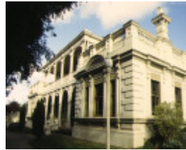
1 rannoch house pakington street newtown front view sep1995