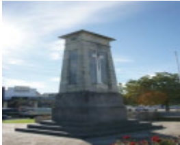
Bairnsdale Cenotaph 2.jpg