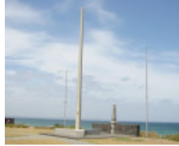
City of Kingston Heritage Study