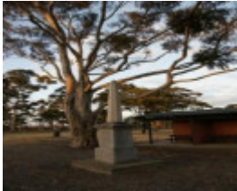
Campbellfield War Memorial.jpg