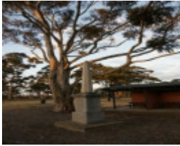
Campbellfield War Memorial.jpg