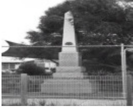
181 - Hume City Heritage Review, 2003