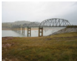
h00989 01 bethanga bridge south from vic 01 jun20044 mz