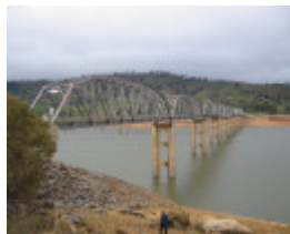
h00989 bethanga bridge bellbridge south side from nsw jun20044 mz