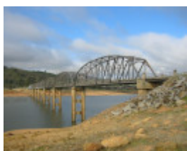
h00989 bethanga bridge bellbridge north nsw side jun20044 mz