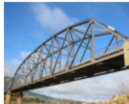
h00989 bethanga bridge bellbridge pratt truss north nsw 01 jun20044 mz