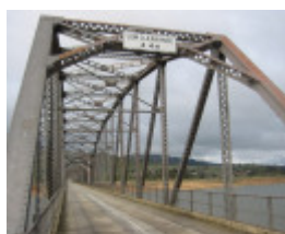
h00989 bethanga bridge bellbridge pratt truss north nsw 02 jun20044 mz