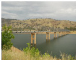
BETHANGA BRIDGE SOHE 2008