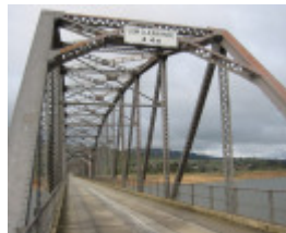
h00989 bethanga bridge bellbridge pratt truss north nsw 02 jun20044 mz