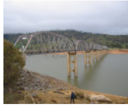
h00989 bethanga bridge bellbridge south side from nsw jun20044 mz