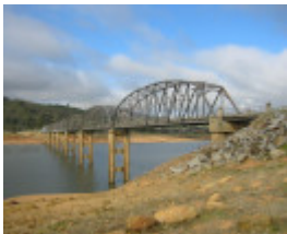
h00989 bethanga bridge bellbridge north nsw side jun20044 mz