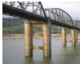
h00989 bethanga bridge bellbridge pylons 01 jun20044 mz