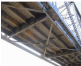
h00989 bethanga bridge bellbridge deck structure jun20044 mz