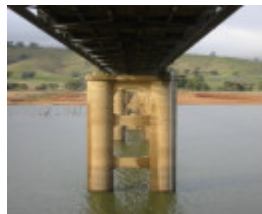
h00989 bethanga bridge bellbridge pylons 02 jun20044 mz