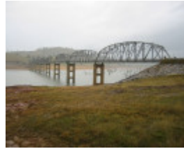
h00989 01 bethanga bridge south from vic 01 jun20044 mz