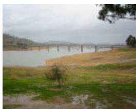
h00989 bethanga bridge south from vic 02 jun20044 mz