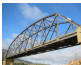
h00989 bethanga bridge bellbridge pratt truss north nsw 01 jun20044 mz