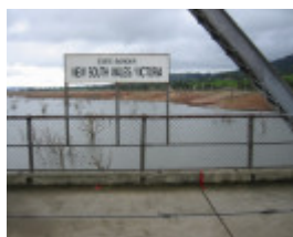
h00989 bethanga bridge bellbridge border jun20044 mz