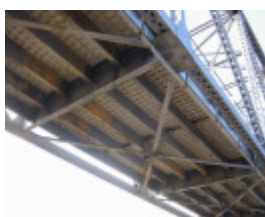
h00989 bethanga bridge bellbridge deck structure jun20044 mz