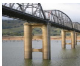
h00989 bethanga bridge bellbridge pylons 01 jun20044 mz