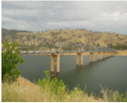
BETHANGA BRIDGE SOHE 2008