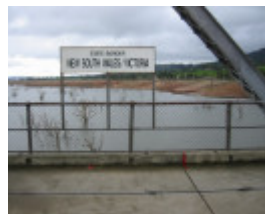
h00989 bethanga bridge bellbridge border jun20044 mz