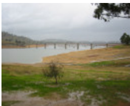
h00989 bethanga bridge south from vic 02 jun20044 mz