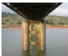
h00989 bethanga bridge bellbridge pylons 02 jun20044 mz