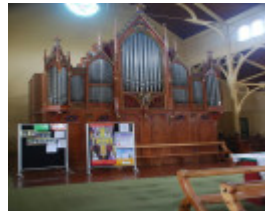
ST KILIANS CATHOLIC CHURCH SOHE 2008