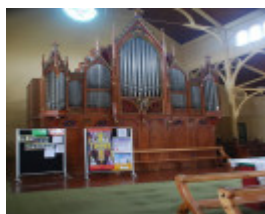
ST KILIANS CATHOLIC CHURCH SOHE 2008