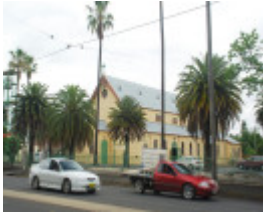
ST KILIANS CATHOLIC CHURCH SOHE 2008