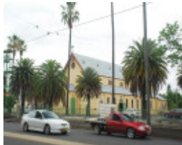
ST KILIANS CATHOLIC CHURCH SOHE 2008