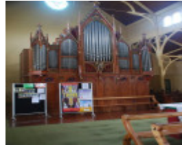
ST KILIANS CATHOLIC CHURCH SOHE 2008