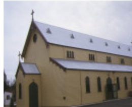
1 st kilians church bendigo side view dec1998