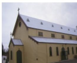
1 st kilians church bendigo side view dec1998