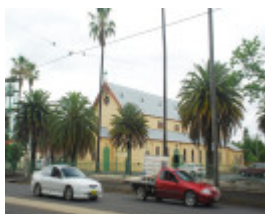
ST KILIANS CATHOLIC CHURCH SOHE 2008