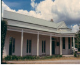
h01697 1 rothbury yendon