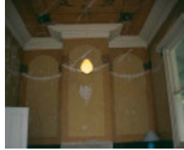
h01697 rothbury yendon drawing room