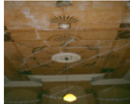
h01697 rothbury drawing