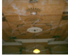
h01697 rothbury drawing