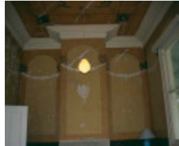
h01697 rothbury yendon drawing room