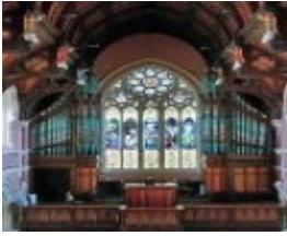
St Mary Star of the Sea_West Melb_organ_KJ_27/6/08