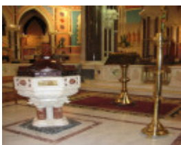
St Mary Star of the Sea_West Melb_font in transept_KJ_27/6/08