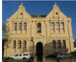
St MAry Star of the Sea_West Melbourne_boys school_KJ_27/6/08