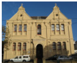
St MAry Star of the Sea_West Melbourne_boys school_KJ_27/6/08