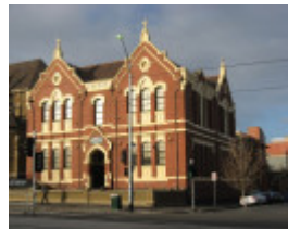
St MAry Star of the Sea_West Melb_girls school_KJ_27/6/08