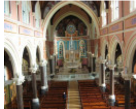
St Mary Star of the Sea_West Melbourne_nave_KJ_27/6/08