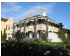
St Mary Star of the Sea_West Melb_presbytery_KJ_27/6/08