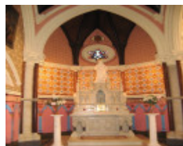
St Mary Star of the Sea_West Melb_chapel_KJ_27/6/08