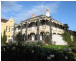
St Mary Star of the Sea_West Melb_presbytery_KJ_27/6/08