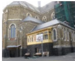
St Mary Star of teh Sea_West Melb_rear with sacristy_KJ_27/6/08