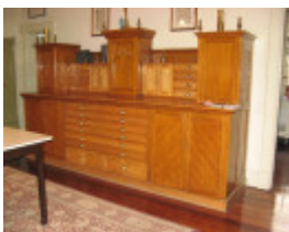
St Mary Star of teh Sea_West melb_vesting bench in sacristy_Kj_27/6/08