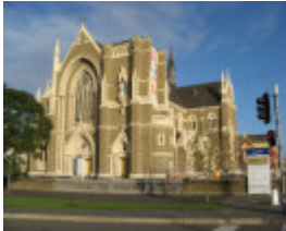
St Mary Star of the Sea_church ext_KJ_27/6/08