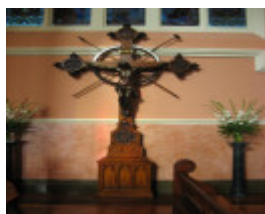
St Mary Star of the Sea_West Melb_crucifix_KJ_27/6/08