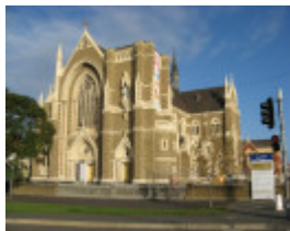
St Mary Star of the Sea_church ext_KJ_27/6/08