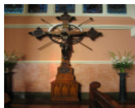
St Mary Star of the Sea_West Melb_crucifix_KJ_27/6/08