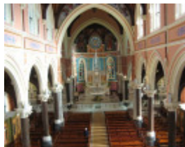
St Mary Star of the Sea_West Melbourne_nave_KJ_27/6/08