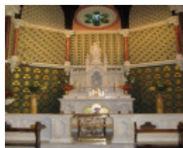
St Mary Star of the Sea_West Melb_chapel_KJ_27/6/08