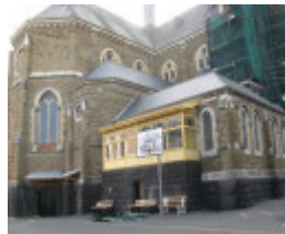
St Mary Star of teh Sea_West Melb_rear with sacristy_KJ_27/6/08