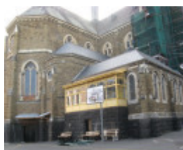
St Mary Star of teh Sea_West Melb_rear with sacristy_KJ_27/6/08