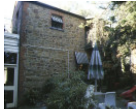
goldmines hotel bendigo apr1990