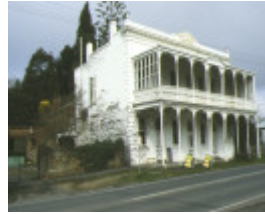
goldmines hotel bendigo north west view jul1990