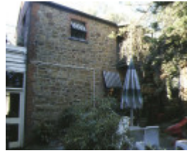
goldmines hotel bendigo apr1990