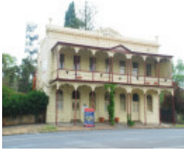
GOLDMINES HOTEL SOHE 2008