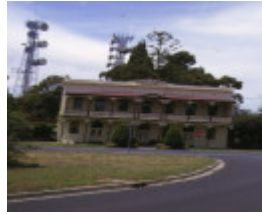
1 goldmines hotel bendigo front view dec1998