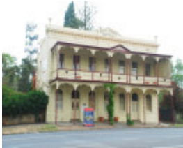
GOLDMINES HOTEL SOHE 2008