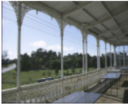
goldmines hotel bendigo balcony