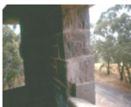
her2003 000127 1 kilmore hume hovell memorial 04 0104 jb