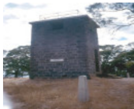
her2003 000127 1 kilmore hume hovell memorial 01 0104 jb