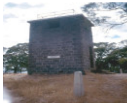
her2003 000127 1 kilmore hume hovell memorial 01 0104 jb