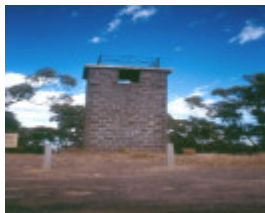
her2003 000127 1 kilmore hume hovell memorial 03 0104 jb