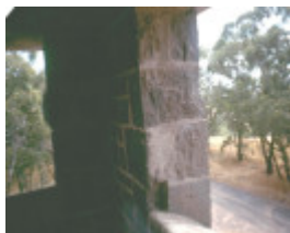
her2003 000127 1 kilmore hume hovell memorial 04 0104 jb