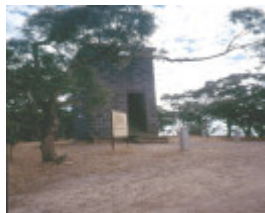
her2003 000127 1 kilmore hume hovell memorial 02 0104 jb