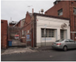
H2050 RICHMOND MALTING LHA 2015 5.JPG