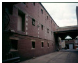
h02050 richmond maltings west elevation 1930 malthouse mz june03