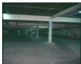
h02050 richmond maltings ground floor 1920 malthouse mz june03