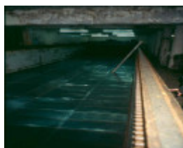
h02050 richmond maltings saladin box 1880 malthouse mz june03