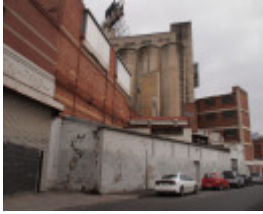
H2050 RICHMOND MALTING LHA 2015 2.JPG