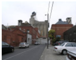
RICHMOND MALTINGS SOHE 2008