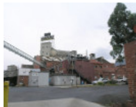
RICHMOND MALTINGS SOHE 2008