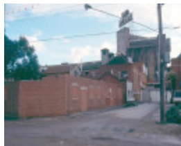
h02050 1 richmond maltings view along gough st ro jun03