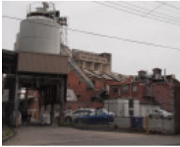
H2050 RICHMOND MALTING LHA 2015 6.JPG