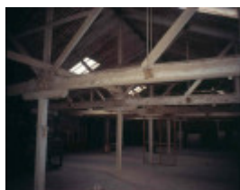
h02050 richmond maltings first floor 1920 malthouse mz june03