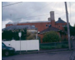
h02050 richmond maltings view from melrose st ro june03