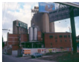
h02050 richmond maltings view from punt rd ro june03