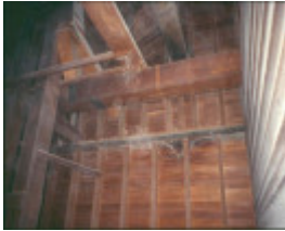
h02050 richmond maltings storage rooms and machinery mz june03