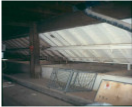
h02050 richmond maltings steeps and grain hoppers 1930 malthouse mz june03