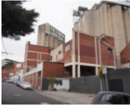
H2050 RICHMOND MALTING LHA 2015 1.JPG