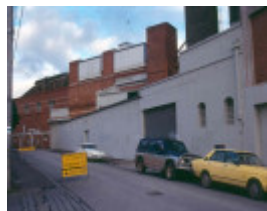
h02050 richmond maltings view east along gough st ro june03