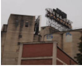
H2050 RICHMOND MALTING LHA 2015 3.JPG