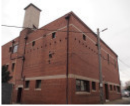
H2050 RICHMOND MALTING LHA 2015 4.JPG