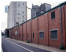
h02050 richmond maltings view from harcourt pde ro june03