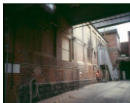
h02050 richmond maltings east elevation 1880 malthouse mz june03