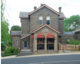
FORMER KILMORE POST OFFICE SOHE 2008