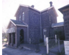
1 former kilmore post office powlett street kilmore front view