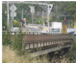
h00050 hawthorn bridge may 05 view east