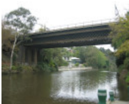
h00050 1 hawthorn bridge may 05