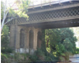
HAWTHORN BRIDGE SOHE 2008