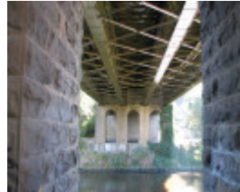
HAWTHORN BRIDGE SOHE 2008