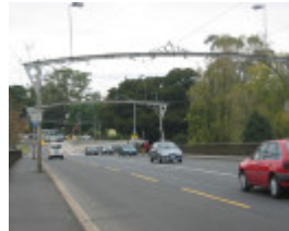
h00050 hawthorn bridge may 05 roadway