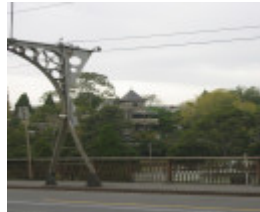
h00050 hawthorn bridge may 05 tram gantry