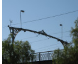
HAWTHORN BRIDGE SOHE 2008