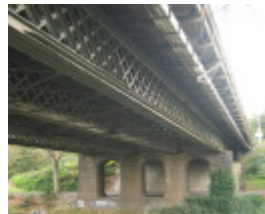
h00050 hawthorn bridge may 05 view from below