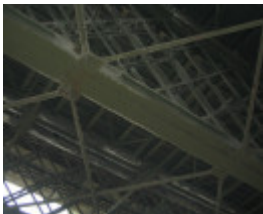
h00050 hawthorn bridge may 05 trusses