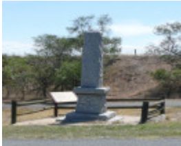
HUME AND HOVELL MONUMENT SOHE 2008