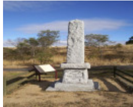
h01547 hume and hovell lara feb04 pm1