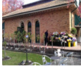
Fawkner Memorial Park