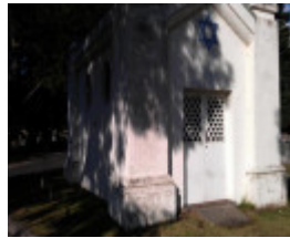
Fawkner Memorial Park