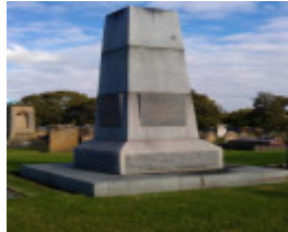
Fawkner Memorial Park