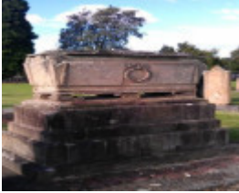
Fawkner Memorial Park