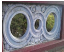
Fawkner Memorial Park