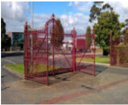
Fawkner Memorial Park