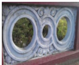
Fawkner Memorial Park