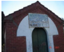
Fawkner Memorial Park