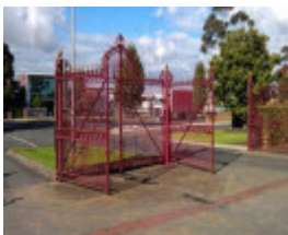
Fawkner Memorial Park