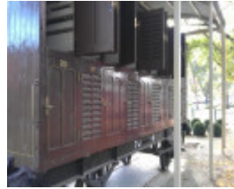
Fawkner Memorial Park