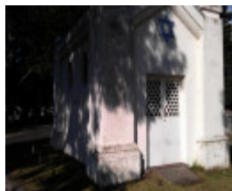
Fawkner Memorial Park