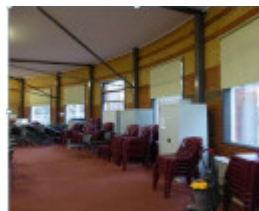
f Chapel of St Joseph interior 3 Aug 2015.JPG