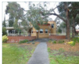
f Chapel of St Joseph 2 Aug 2015.JPG