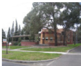
Chapel of St Joseph 5 July 2011 KJ (9).jpg