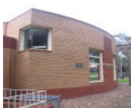
Chapel of St Joseph