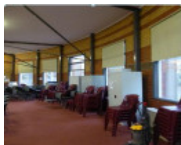
f Chapel of St Joseph interior 2 Aug 2015.JPG