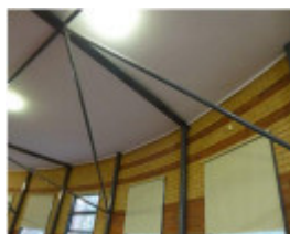
f Chapel of St Joseph interior 4.JPG