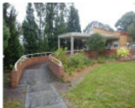
f Chapel of St Joseph 3 Aug 2015.JPG