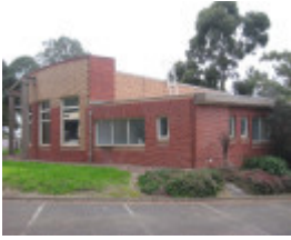
Chapel of St Joseph