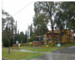
f Chapel of St Joseph 1 Aug 2015 .JPG