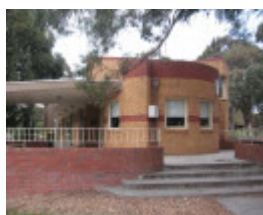
Chapel of St Joseph