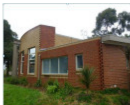
f Chapel of St Joseph rear western side Aug 2015.JPG