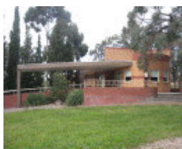
Chapel of St Joseph