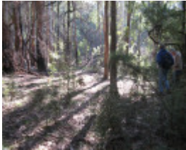
Stringybark Creek site