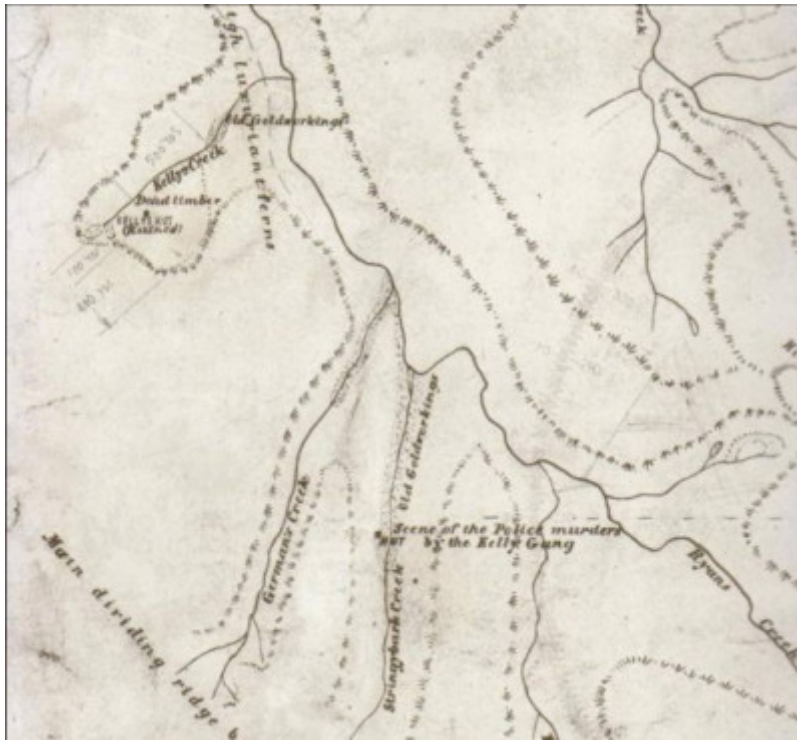
H2205 1884 Surveyors Plan