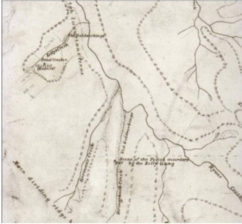
H2205 1884 Surveyors Plan