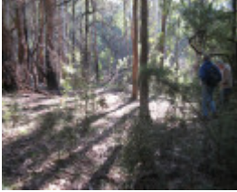
Stringybark Creek site