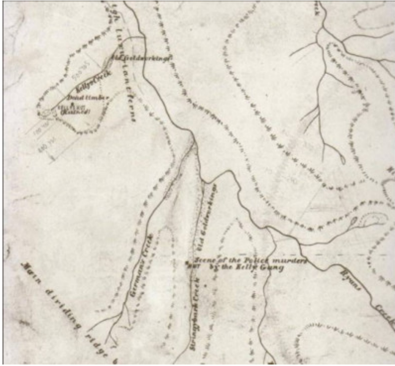
H2205 1884 Surveyors Plan