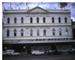
1 former mining exchange building bendigo front view beehive building