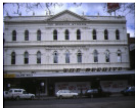
1 former mining exchange building bendigo front view beehive building