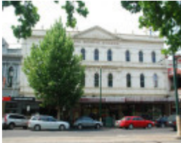
BEEHIVE BUILDING COMPLEX SOHE 2008