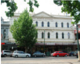
BEEHIVE BUILDING COMPLEX SOHE 2008