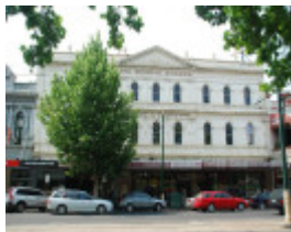
BEEHIVE BUILDING COMPLEX SOHE 2008