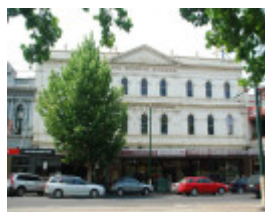
BEEHIVE BUILDING COMPLEX SOHE 2008