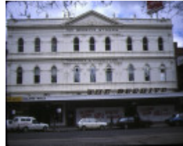
1 former mining exchange building bendigo front view beehive building