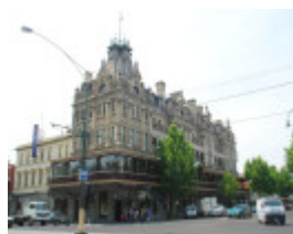
SHAMROCK HOTEL SOHE 2008