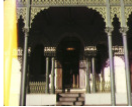
shamrock hotel bendigo entrance nov1989