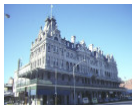
1 shamrock hotel bendigo front elevation jul1984