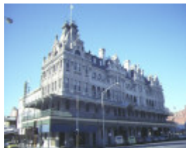
1 shamrock hotel bendigo front elevation jul1984