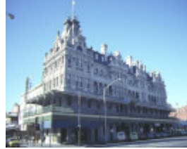
1 shamrock hotel bendigo front elevation jul1984