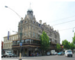
SHAMROCK HOTEL SOHE 2008