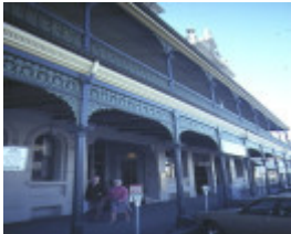
shamrock hotel bendigo front verandah jul1984