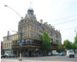
SHAMROCK HOTEL SOHE 2008