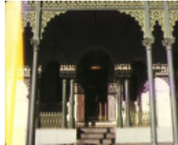
shamrock hotel bendigo entrance nov1989