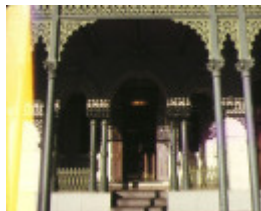
shamrock hotel bendigo entrance nov1989