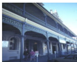
shamrock hotel bendigo front verandah jul1984