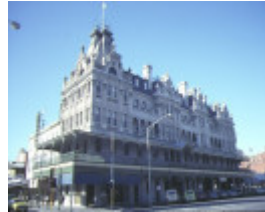
1 shamrock hotel bendigo front elevation jul1984