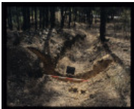
DAM WALL AND ASSOCIATED FEATURES BENDIGO MINING NL FEATURE 47 EXCAVATION