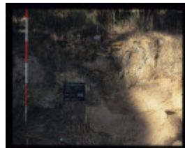
DAM WALL AND ASSOCIATED FEATURES BENDIGO MINING NL FEATURE 47 EXCAVATION