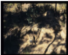
DAM WALL AND ASSOCIATED FEATURES BENDIGO MINING NL FEATURE 47 EXCAVATION