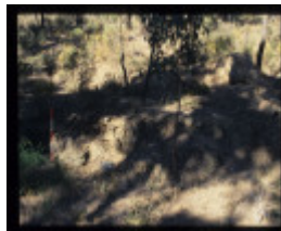
DAM WALL AND ASSOCIATED FEATURES BENDIGO MINING NL FEATURE 47 EXCAVATION