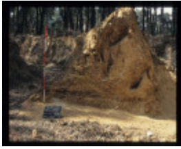
DAM WALL AND ASSOCIATED FEATURES BENDIGO MINING NL FEATURE 47 EXCAVATION