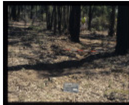
DAM WALL AND ASSOCIATED FEATURES BENDIGO MINING NL FEATURE 47 EXCAVATION