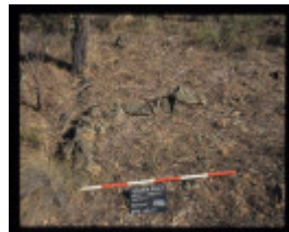
DAM WALL AND ASSOCIATED FEATURES BENDIGO MINING NL FEATURE 47 EXCAVATION