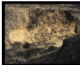
DAM WALL AND ASSOCIATED FEATURES BENDIGO MINING NL FEATURE 47 EXCAVATION