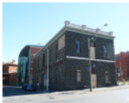
PRATTS WAREHOUSE SOHE 2008