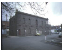
h00955 pratts warehouse camp street ballarat front view aug1985