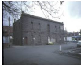
h00955 pratts warehouse camp street ballarat front view aug1985