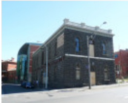
PRATTS WAREHOUSE SOHE 2008