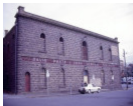
h00955 1 pratts warehouse mair and camp st ballarat east elevation she project 2003