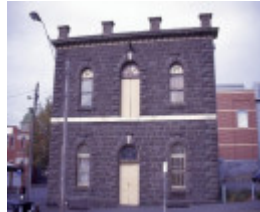
h00955 pratts warehouse mair and camp st ballarat front view she project 2003