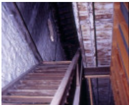
h00955 pratts warehouse mair and camp st ballarat stairs she project 2003