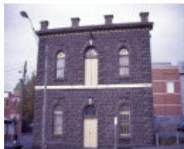
h00955 pratts warehouse mair and camp st ballarat front view she project 2003