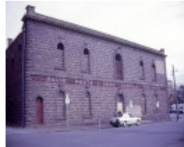
h00955 1 pratts warehouse mair and camp st ballarat east elevation she project 2003