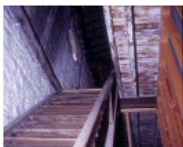
h00955 pratts warehouse mair and camp st ballarat stairs she project 2003