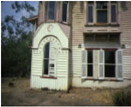
the eyrie reginald street quarry hill bendigo ground floor detail feb1983