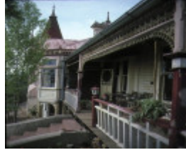
the eyrie reginald street quarry hill bendigo verandah feb1983