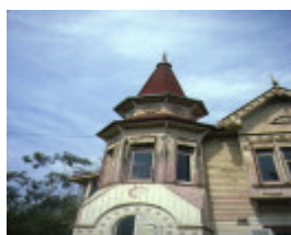
1 the eyrie reginald street quarry hill bendigo turret view feb1983