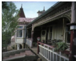
the eyrie reginald street quarry hill bendigo verandah feb1983