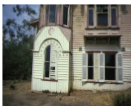
the eyrie reginald street quarry hill bendigo ground floor detail feb1983