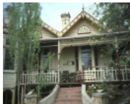
the eyrie reginald street quarry hill bendigo front view feb1983