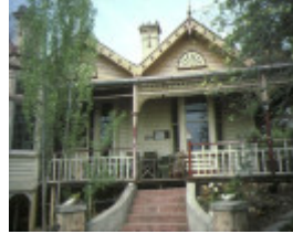
the eyrie reginald street quarry hill bendigo front view feb1983