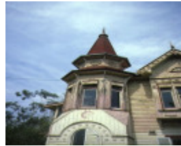
1 the eyrie reginald street quarry hill bendigo turret view feb1983