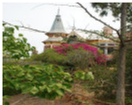
THE EYRIE SOHE 2008