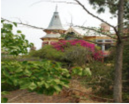
THE EYRIE SOHE 2008