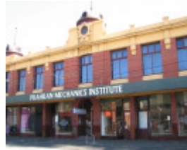
PRAHRAN MECHANICS INSTITUTE SOHE 2008