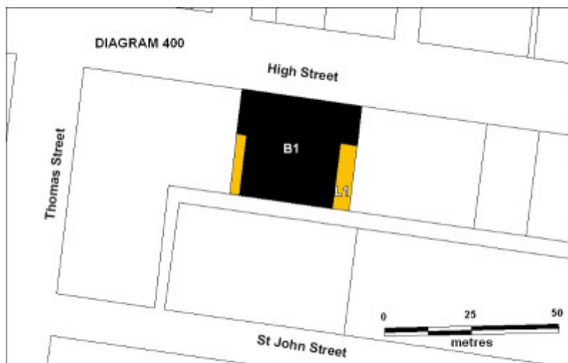
h00400 h prahran mechanics map