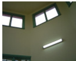
h00400 top floor window