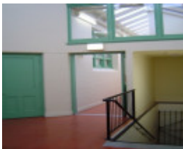
h00400 top floor