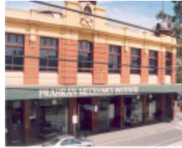
h00400 1 facade full