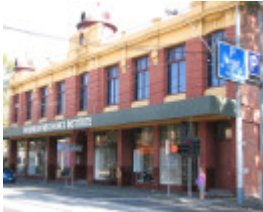
PRAHRAN MECHANICS INSTITUTE SOHE 2008