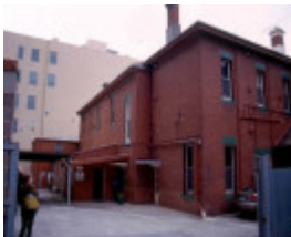
h01062 mary mckillop 1902 rear2