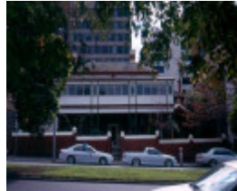
h01062 mary mckillop 1902 longshot