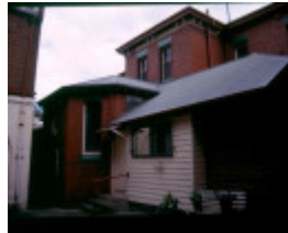
h01062 mary mckillop 1902 east chapel