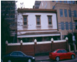
h01062 mary mckillop 1872 front