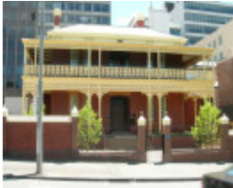
MARY MACKILLOP HOUSE SOHE 2008