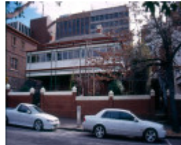
h01062 mary mckillop 1902 exterior