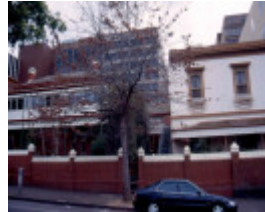
h01062 1 mary mckillop exterior sept04