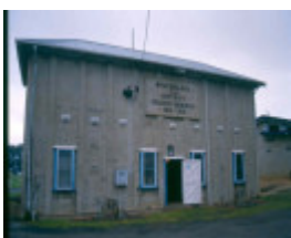
Winchelsea Grandstand Rear September 04