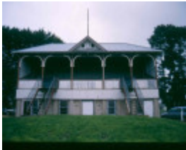
h01525 1 winchelsea grandstand front1