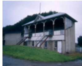
h01525 winchelsea grandstand front sept04