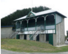
MEMORIAL GRANDSTAND AND GATES SOHE 2008