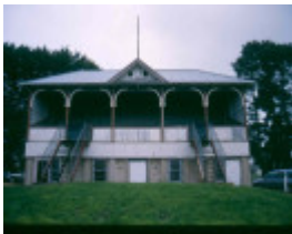
h01525 1 winchelsea grandstand front1