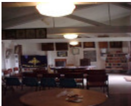
h01525 winchelsea grandstand rsl room general