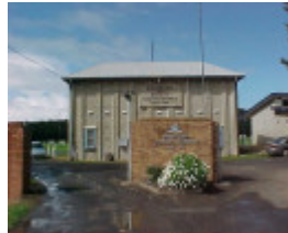
h01525 winchelsea grandstand longshot sept04