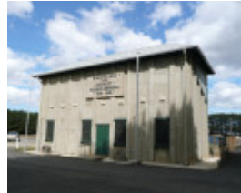
MEMORIAL GRANDSTAND AND GATES SOHE 2008