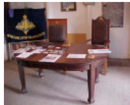
h01525 winchelsea grandstand rsl room table