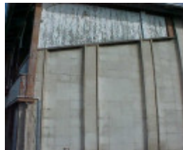
h01525 winchelsea grandstand side1