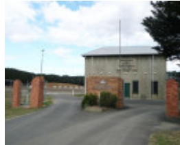
MEMORIAL GRANDSTAND AND GATES SOHE 2008