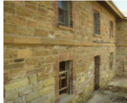
old police barracks bendigo side wall & courtyard may1993