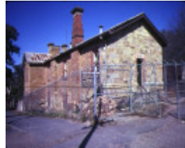
1 old police barracks bendigo side view aug1982