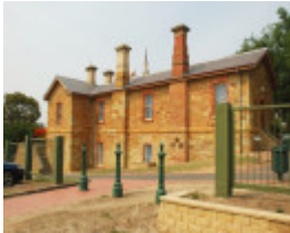
OLD POLICE BARRACKS SOHE 2008