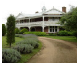
h01065 holy trinity anglican cathedral precinct wangaratta bishops lodge driveway 2005