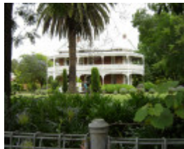
h01065 holy trinity anglican cathedral precinct wangaratta bishops lodge 2005