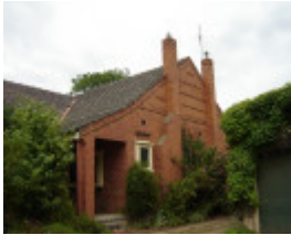
h01065 holy trinity anglican cathedral precinct wangaratta house 11 the close 2005