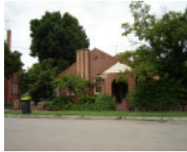
h01065 holy trinity anglican cathedral precinct wangaratta house 7 the close 2005