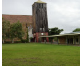
h01065 holy trinity anglican cathedral precinct wangaratta new tower 2005