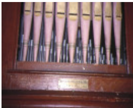
Bevington Pipe Organ August 1994