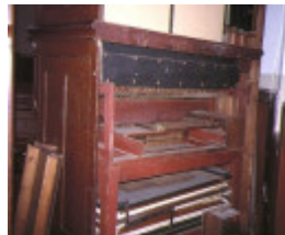
Bevington Pipe Organ Rear View August 1994