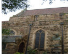
h01065 holy trinity anglican cathedral precinct wangaratta south side 2005