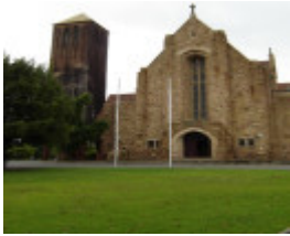
h01065 1 holy trinity anglican cathedral precinct wangaratta east side 2005