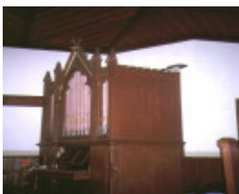
Bevington Pipe Organ Side View of Pipe Case August 1994