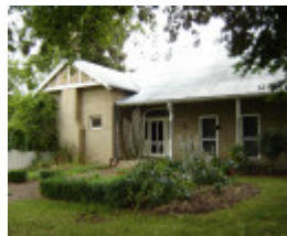
h01065 holy trinity anglican cathedral precinct wangaratta deanery 13 the close 2005