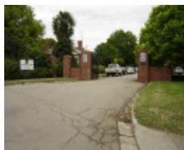
h01065 holy trinity anglican cathedral precinct wangaratta east close gates 2005