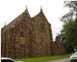
h01065 holy trinity anglican cathedral precinct wangaratta west side 2005