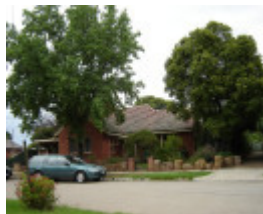
h01065 holy trinity anglican cathedral precinct wangaratta choirmasters house 3 the close 2005