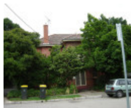
h01065 holy trinity anglican cathedral precinct wangaratta holy trinity house 5 the close 2005