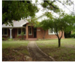
h01065 holy trinity anglican cathedral precinct wangaratta armstrong house 41 ovens st 2005