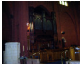
h01065 holy trinity anglican cathedral precinct wangaratta willis organ and pulpit 2005