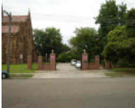
h01065 holy trinity anglican cathedral precinct wangaratta north close gates 2005