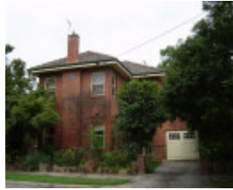
h01065 holy trinity anglican cathedral precinct wangaratta 9 the close 2005