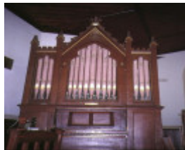
Bevington Pipe Organ August 1994