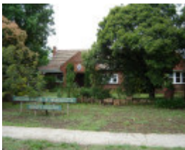
h01065 holy trinity anglican cathedral precinct wangaratta bishops registry 2005