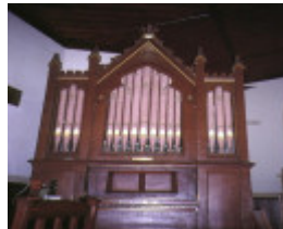
Bevington Pipe Organ August 1994