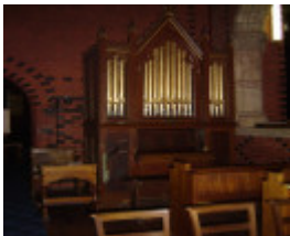
h01065 holy trinity anglican cathedral precinct wangaratta bevington pipe organ 2005