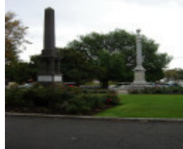
h01065 holy trinity anglican cathedral precinct wangaratta war memoria gardens 2005