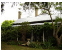
h01065 holy trinity anglican cathedral precinct wangaratta deanery rear