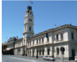
BALLARAT POST OFFICE SOHE 2008