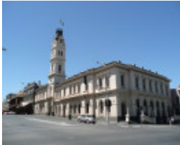
BALLARAT POST OFFICE SOHE 2008