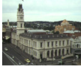
1 ballarat post office aerial view 1992