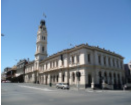
BALLARAT POST OFFICE SOHE 2008