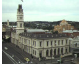
1 ballarat post office aerial view 1992