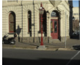
B1 - Reconstructed lamp set back 1m from street corner