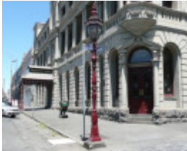
GAS LAMPS SOHE 2008