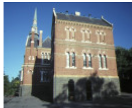
camp hill school 1976 bendigo side elevation jul1984