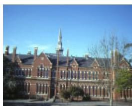
camp hill school 1976 bendigo rear view jul1984