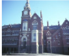
camp hill school 1976 bendigo front view