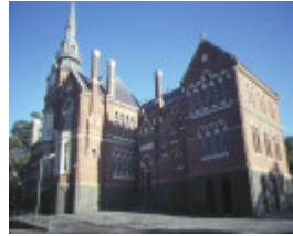
1 camp hill school 1976 bendigo front elevation jul1984