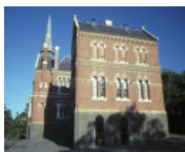
camp hill school 1976 bendigo side elevation jul1984