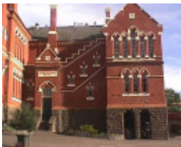
h01642 camp hill central school no 1976 gaol road rosalind park bendigo close up she project 2004