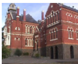
h01642 camp hill central school no 1976 gaol road rosalind park bendigo front cnr she project 2004