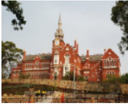
CAMP HILL CENTRAL SCHOOL NO.1976 SOHE 2008