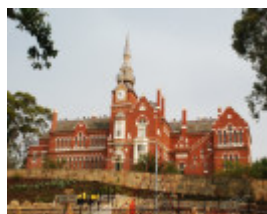
CAMP HILL CENTRAL SCHOOL NO.1976 SOHE 2008