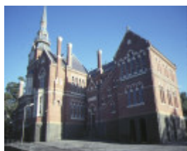
1 camp hill school 1976 bendigo front elevation jul1984