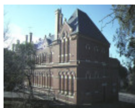
camp hill school 1976 bendigo rear corner jul1984