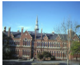
camp hill school 1976 bendigo rear view jul1984