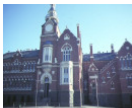
camp hill school 1976 bendigo front view