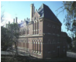
camp hill school 1976 bendigo rear corner jul1984