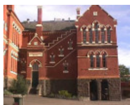
h01642 camp hill central school no 1976 gaol road rosalind park bendigo close up she project 2004