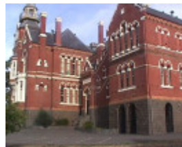
h01642 camp hill central school no 1976 gaol road rosalind park bendigo front cnr she project 2004