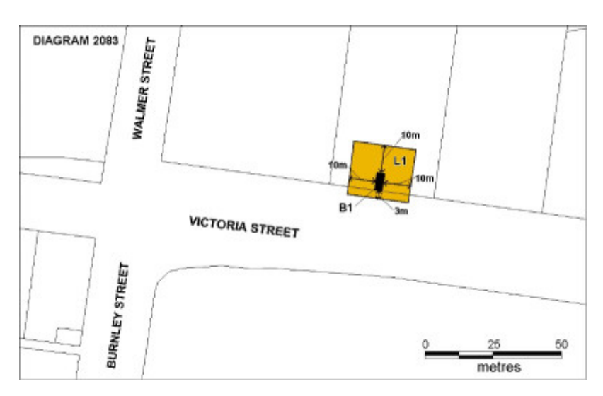
h02083 skipping girl plan june2005 mz