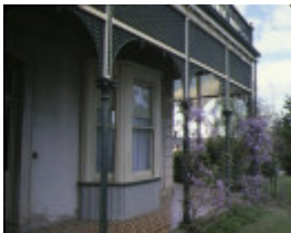
coolock house bendigo detail of verandah oct1980