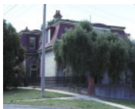
1 coolock house bendigo front view from street oct1988