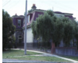
1 coolock house bendigo front view from street oct1988