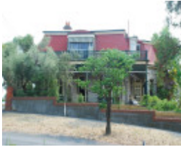
COOLOCK HOUSE SOHE 2008