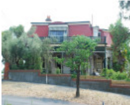
COOLOCK HOUSE SOHE 2008