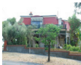
COOLOCK HOUSE SOHE 2008