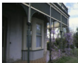
coolock house bendigo detail of verandah oct1980