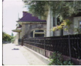
coolock house bendigo detail of front entrance & iron fence oct1988