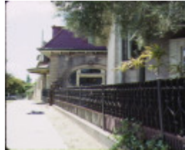
coolock house bendigo detail of front entrance & iron fence oct1988