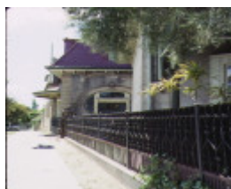
coolock house bendigo detail of front entrance & iron fence oct1988