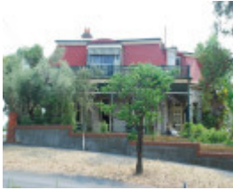
COOLOCK HOUSE SOHE 2008