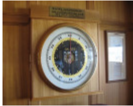
Flemington Racecourse_chronographic clock_KJ_15 Jun 09