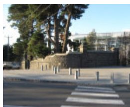
Flemington Racecourse_blue stone walls near Hill Entrance_KJ_15 Jun 09