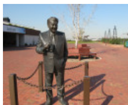
Flemington Racecourse_Bart Cummings statue_KJ_15 Jun 09