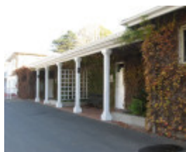
Flemington Racecourse_men's toilets_KJ_15 Jun 09