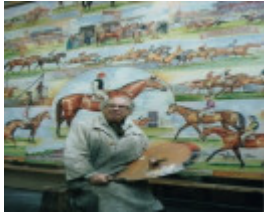
Freedman with part of mural