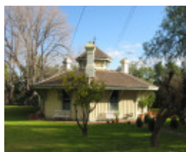
Flemington racecourse_former Convalescent jockeys Lodge_KJ_July 09 July 09