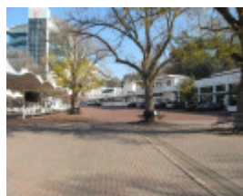
Flemington Racecourse_betting ring & tote buildings_KJ_15 Jun 09