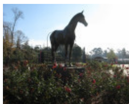
Flemington Racecourse_Phar Lap statue_KJ 15 Jun 09