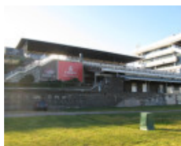
Flemington Racecourse_remnants of blue stone stand_KJ_17 July 09