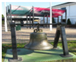
Flemington Racecourse_brass bell_KJ_15 Jun 09