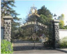
Flemington Racecourse_entrance to Members Drive & entrance box_KJ_15 Jun 09