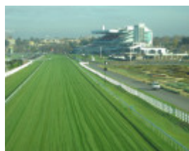
Flemington Racecourse_straight and stands_KJ_15 Jun 09