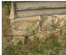
Castlemaine military quarters_stone base_7 Feb 08