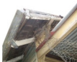
Castlemaine military quarters_shingles_7 Feb 08