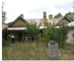
Fmr Castlemaine military quarters_rear view_KJ_7 Feb 08