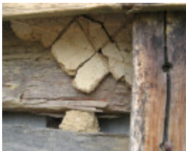
Fmr Castlemaine military quarters_slabs and plaster_Kj_7 Feb 08