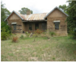
Former Castlemaine military quarters_front view_KJ_7 Feb 2008