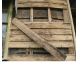
Castlemaine military quarters_slabs under weatherboards_KJ_7 Feb 08