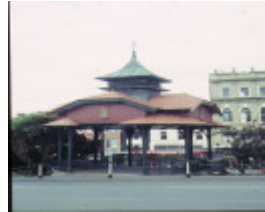
1 titanic memorial bandstand ballarat front view 1993