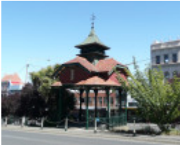
TITANIC MEMORIAL BANDSTAND SOHE 2008