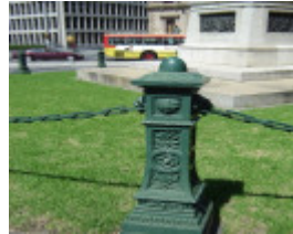
h00047 fence post