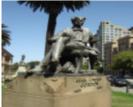
Detail Adam Lindsay Gordon