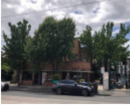
921-923 High Street, Armadale (2).jpeg