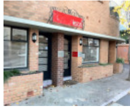
Flats & shops, 921 High Street