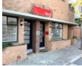
Flats & shops, 921 High Street