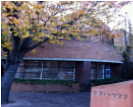
Flats & shops, 921 High Street