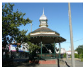
QUEEN ALEXANDRA BANDSTAND SOHE 2008