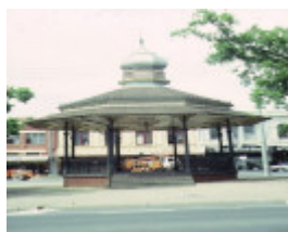
1 queen alexandra bandstand ballarat front detail