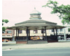
1 queen alexandra bandstand ballarat front detail