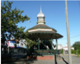
QUEEN ALEXANDRA BANDSTAND SOHE 2008