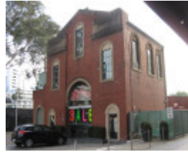
South Yarra tram substation