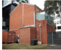
South Yarra tram substation rear view