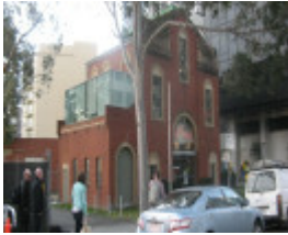
Tram substation Sth Yarra 5 Sep 2012 KJ (1).JPG