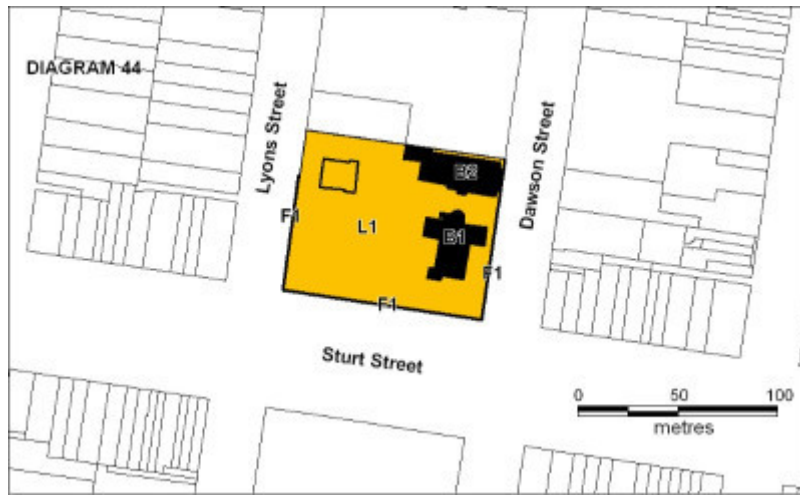
h00044 st andrews kirk plan sept2004