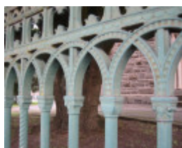
St Andrews Kirk Ballarat Fence Oct 03