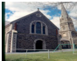
h00044 st andrews kirk ballarat west transept oct03