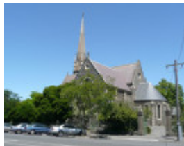
ST ANDREWS UNITING CHURCH SOHE 2008