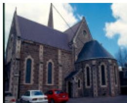
h00044 st andrews kirk ballarat north elevation oct03