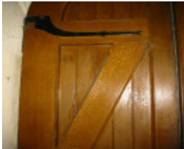
St Andrews Kirk Door Detail 01 Oct 03