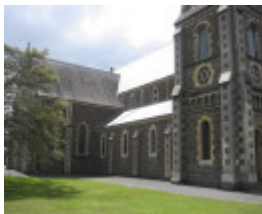
St Andrews Kirk West Elevation Oct 03