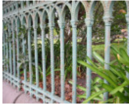
St Andrews Kirk Ballarat Fence 03 Oct 03