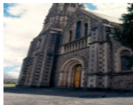
h00044 1 st andrews kirk ballarat front oct03