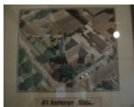
St Andrews Kirk Ballarat Aerial Oct 03