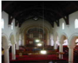
St Andrews Kirk Interior 01 Oct 03