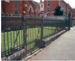
St Andrews Kirk Ballarat Fence 04 Oct 03