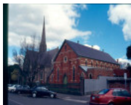
h00044 st andrews ballarat sunday school oct03