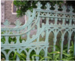
St Andrews Kirk Ballarat Fence 02 Oct 03