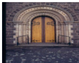
St Andrews Kirk Ballarat Door Detail Oct 03