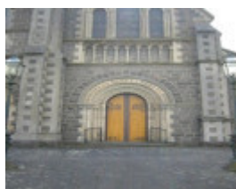
St Andrews Kirk Ballarat Door Oct 03