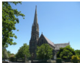
ST ANDREWS UNITING CHURCH SOHE 2008