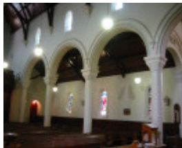
St Andrews Kirk Interior 04 Oct 03