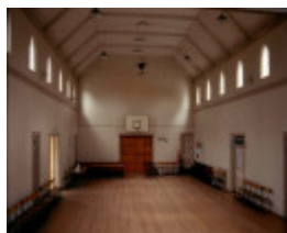
h00044 st andrews ballarat sunday school interior oct03