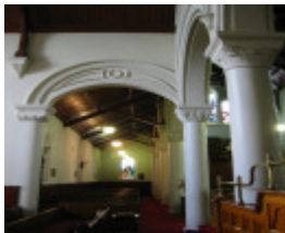
St Andrews Kirk Interior 03 Oct 03