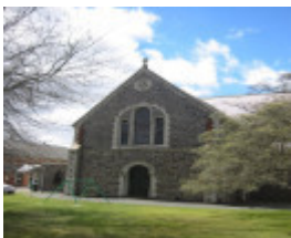
St Andrews Kirk West Transept 02 Oct 03