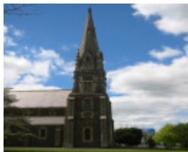
St Andrews Kirk Spire Oct 03