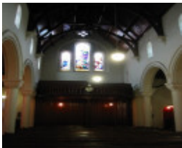
St Andrews Kirk Interior 03 Oct 03