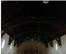
St Andrews Kirk Interior 02 Oct 03