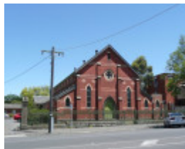
ST ANDREWS UNITING CHURCH SOHE 2008