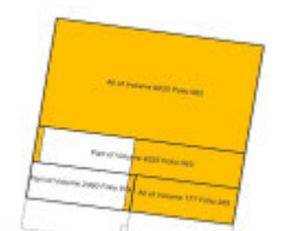
St Patricks Ballarat cadastral layout.JPG