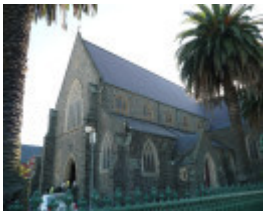
ST PATRICKS CATHEDRAL AND HALL SOHE 2008