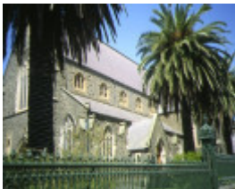
1 st patrick's cathedral ballarat exterior view of cathedral