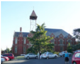
ST PATRICKS CATHEDRAL AND HALL SOHE 2008