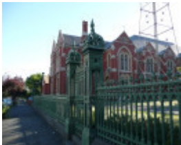
ST PATRICKS CATHEDRAL AND HALL SOHE 2008