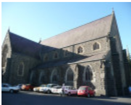
ST PATRICKS CATHEDRAL AND HALL SOHE 2008