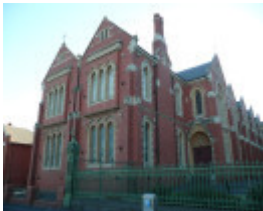
ST PATRICKS CATHEDRAL AND HALL SOHE 2008