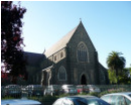
ST PATRICKS CATHEDRAL AND HALL SOHE 2008