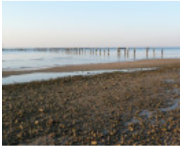
FORMER MINERAL SPRINGS, CLIFTON SPRINGS SOHE 2008