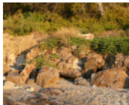
FORMER MINERAL SPRINGS, CLIFTON SPRINGS SOHE 2008