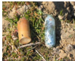
H2088 Clifton Springs Aug 05 artefacts