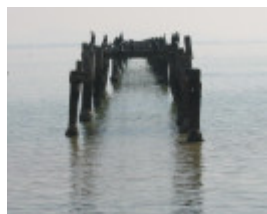
H2088 Clifton Springs Aug 05 long jetty