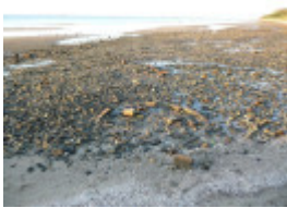
FORMER MINERAL SPRINGS, CLIFTON SPRINGS SOHE 2008