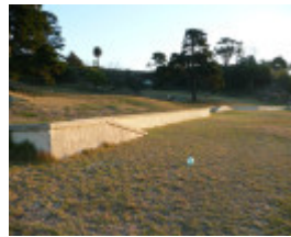
FORMER MINERAL SPRINGS, CLIFTON SPRINGS SOHE 2008