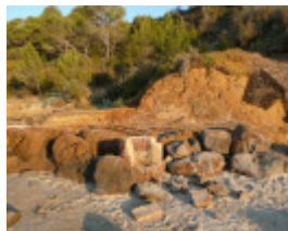
FORMER MINERAL SPRINGS, CLIFTON SPRINGS SOHE 2008