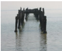
H2088 Clifton Springs Aug 05 long jetty