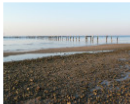
FORMER MINERAL SPRINGS, CLIFTON SPRINGS SOHE 2008