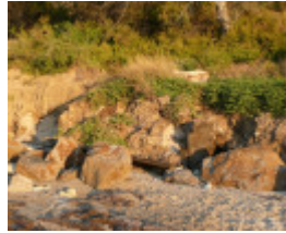
FORMER MINERAL SPRINGS, CLIFTON SPRINGS SOHE 2008