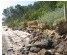
H2088 Clifton Springs Aug 05