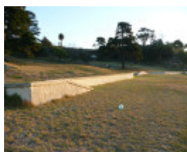
FORMER MINERAL SPRINGS, CLIFTON SPRINGS SOHE 2008