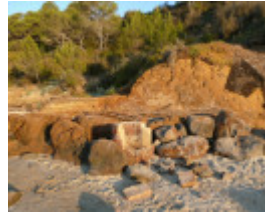
FORMER MINERAL SPRINGS, CLIFTON SPRINGS SOHE 2008