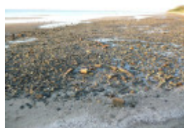
FORMER MINERAL SPRINGS, CLIFTON SPRINGS SOHE 2008