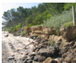
H2088 Clifton Springs Aug 05