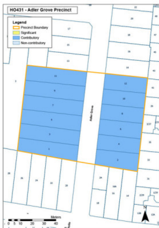
Adler Grove Precinct Map