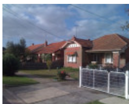
Adler Grove (east side)