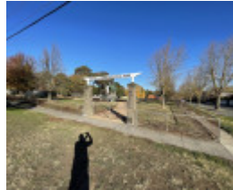
Havelock St park