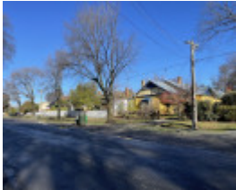
Crompton St 115-121