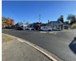
Doveton St N 449-451 shops